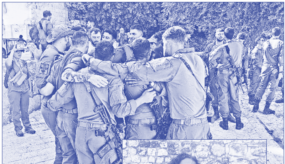
Praying with the IDF

These soldiers , mostly 18- or 19-year-olds who had recently completed basic training, were grateful to learn that Believers in Yeshua came from America to support them by filming a television program that showcases the truth of Israel. That same day, we learned that a soldier had died in a firefight during the "ceasefire" between Hamas and Israel. In response, a furious Prime Minister Netanyahu ordered missile strikes on Gaza, resulting in explosions that we heard while we filmed in nearby Ashkelon.