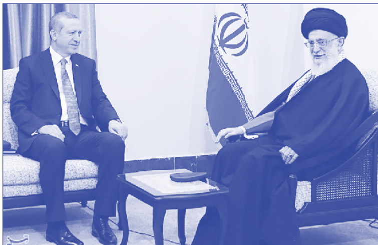
Turkey's President Erdoğan meeting with Iran's Supreme Leader Ali Khamenei

A non-Palestinian group governing Gaza and disarming Hamas appeals to Israelis. We want to protect our soldiers’ lives. One problem with this idea, however, is that the international community loves “instant” solutions. Israelis, on the other hand, are painfully aware that such plans rarely work in the Middle East, especially regarding the Palestinian conflict.