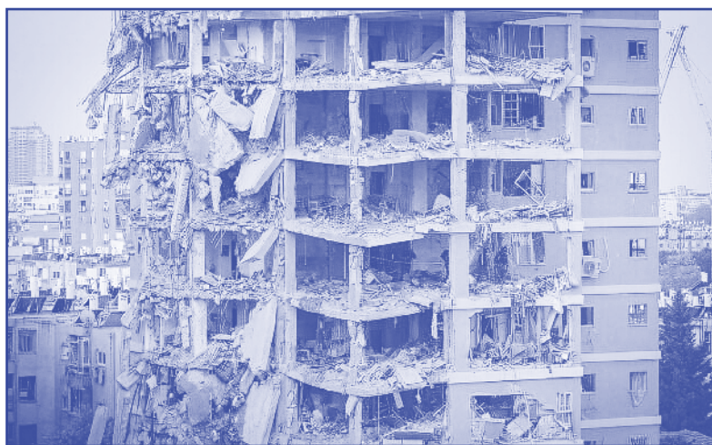
An apartment building in Bat Yam, Israel was destroyed by an Iranian missile.

Still, Israelis diligently obeyed safety protocols — either remaining close to a safe room or leaving a vehicle and lying face down on the ground when sirens sounded. As I was out one day, there were three consecutive attacks before I reached home. It was frightening as I sheltered in a ditch during one, lay on the ground in another, and took cover by a concrete wall for the third. As the days passed, stress and fatigue increased because of the ongoing warnings — both day and night. Though Israelis died every day from the attacks, I didn't hear anyone complaining or wishing that the war would end just to be over. Most Israelis understood the existential nature of the war — success was about survival for us and future generations . We wanted to put an end to Iran's nuclear aspirations and their threats to destroy Israel.